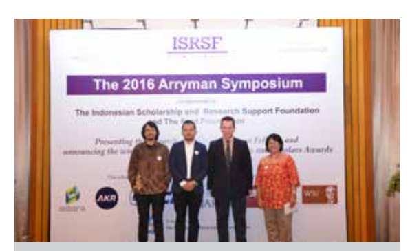
The 2016 Arryman Symposium