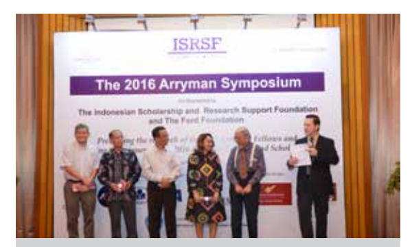
The 2016 Arryman Symposium