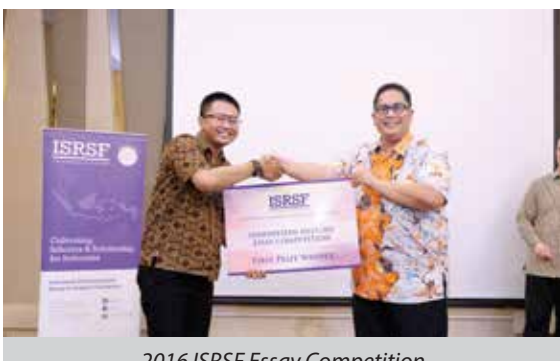
2016 ISRSF Essay Competition