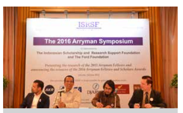
The 2016 Arryman Symposium