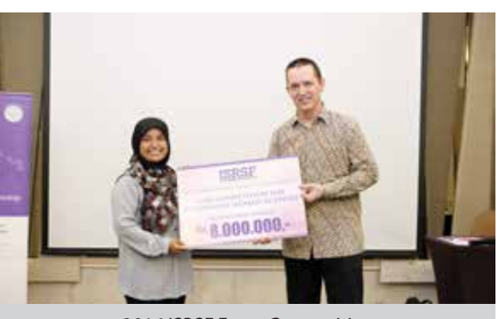
2016 ISRSF Essay Competition