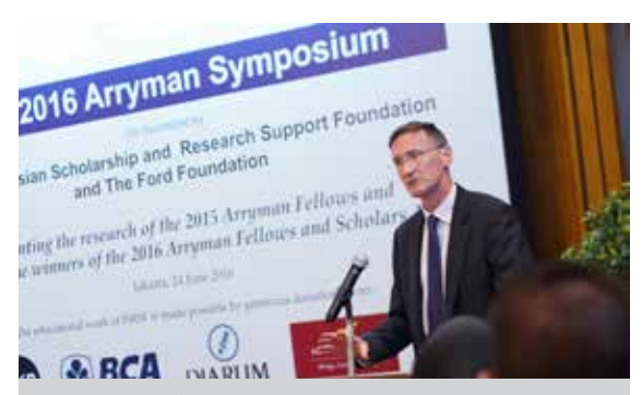
The 2016 Arryman Symposium