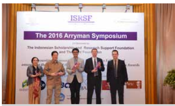
The 2016 Arryman Symposium