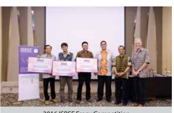
2016 ISRSF Essay Competition