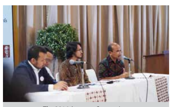
The 2016 Arryman Symposium