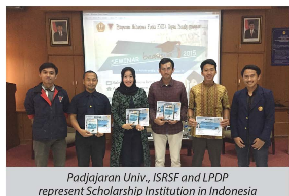
Padjajaran Univ., ISRSF and LPDP represent Scholarship Institution in Indonesia