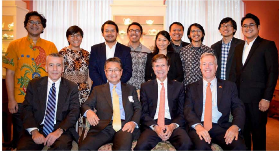
The Arryman at the ASEAN Ambassador Conference