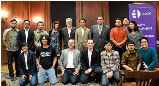
Symposium '65 at EDGS