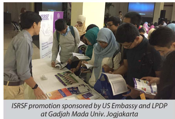
ISRSF promotion sponsored by US Embassy and LPDP at Gajah Mada Univ. Jogjakarta