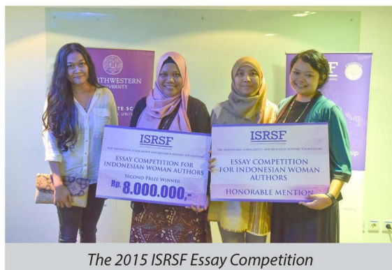
The 2015 ISRSF Essay Competition