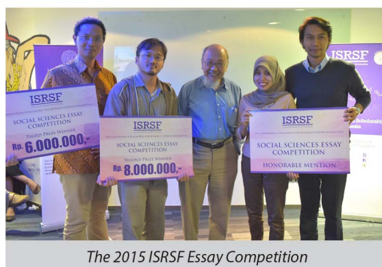
The 2015 ISRSF Essay Competition

The three categories were History, Indonesian Women Authors, and the Social Sciences. We give five months for writers to submit their essays starting June 1st until November 30th 2015.