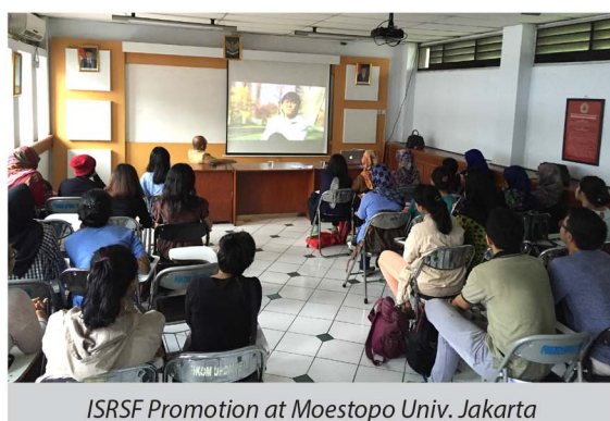
ISRSF Promotion at Moestopo Univ. Jakarta