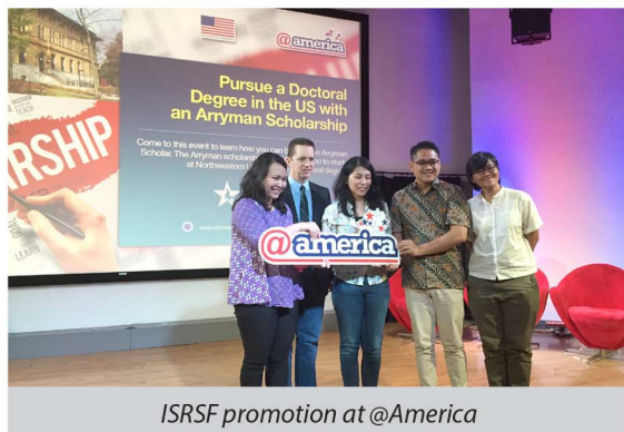
ISRSF promotion at @America