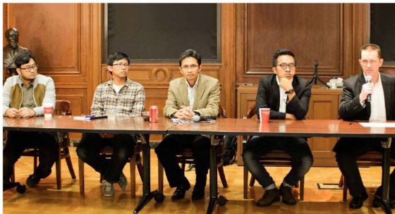
The Arryman at Symposium '65 at EDGS