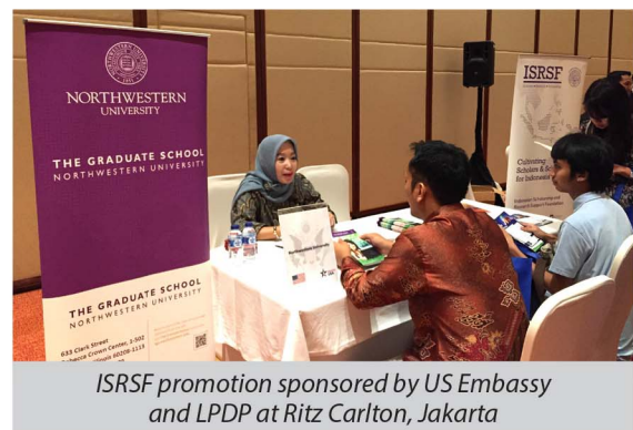
ISRSF promotion sponsored by US Embassy and LPDP at Ritz Carlton, Jakarta