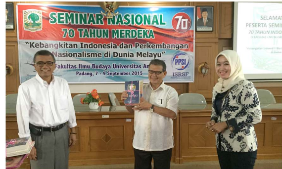
ISRSF co sponsor for FIB event at Univ. Andalas - Padang

Other than promoting on events, ISRSF was also prominent in giving information on the scholarship and essay competitions through social media such as Facebook and Twitter.