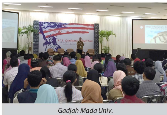
Gajah Mada Univ.