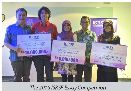
The 2015 ISRSF Essay Competition