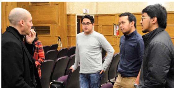
The Arrymans with Joshua Openheimer - "Senyap" Movie Screening