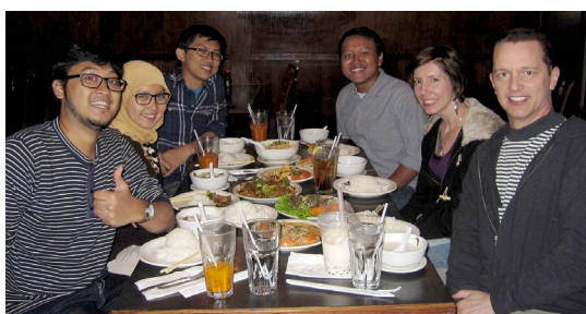
Welcoming Dinner with EDGS