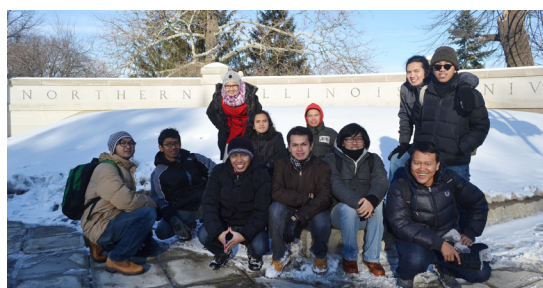
Visit Northern Illinois University