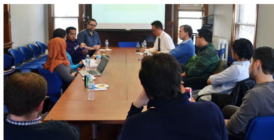
Academic activity at the Campus